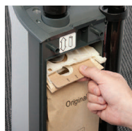
Quick-change filter bag and convenient spare bag storage

Specifications are subject to change without notice.