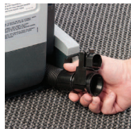
Easy access to clogs, minimizing potential downtime