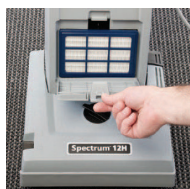
Industry-leading three-stage sealed H.E.P.A. filtration removes 99.97% of all particles >0.3 microns for improved IAQ