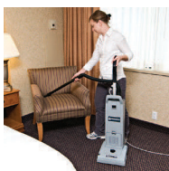
Quick-draw wand and onboard tools simplify detailing work