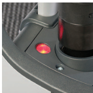
Indicator light shows when bag is full or when vacuum is clogged